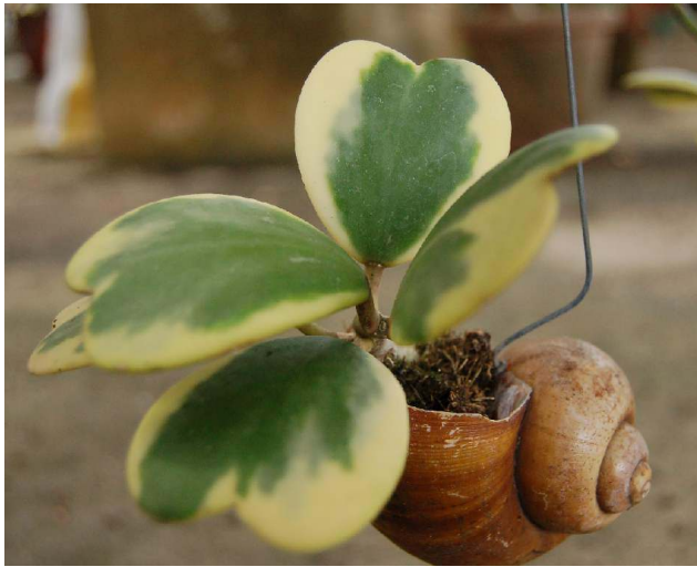
Left: A young sweet heart hoya plant grown inside a hanging snail shell makes a good gift plant for Valentine’s Day. (LJH)

The sweet heart hoya is botanically known as Hoya kerrii and belongs to the frangipani family, Apocynaceae. Together with other Hoya species, it used to be classified in the milkweed family, Asclepiadaceae, which has now been subsumed into the frangipani family. The sweet heart hoya is known as “凹叶球兰” in Chinese which literally translates into ‘dented-leaf hoya’ due to the presence of a cleft in its leaves. It is also frequently referred to as “心叶球兰” (heart leaf hoya in Chinese).