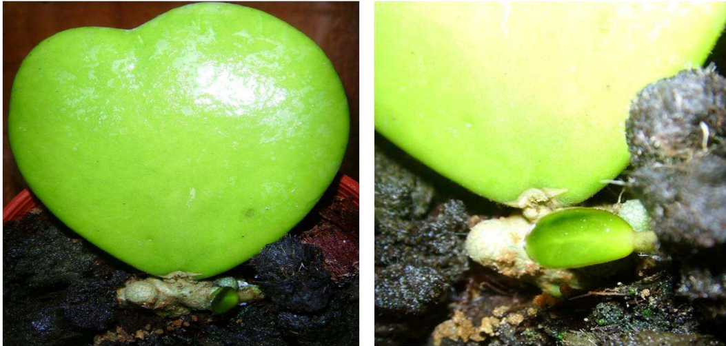
Left: A leaf cutting of the sweet heart hoya showing new growth at the base of the leaf. (LC)

Like most other hoyas, the sweet heart hoya can be vegetatively propagated most easily by stem-cuttings. Take care when taking cuttings as the plant secretes a white sticky sap that is poisonous. Each stem-cutting should have at least two nodes where root formation can take place. Take stem-cuttings that are semi-ripe, i.e. stems should neither be not too young and tender nor too old and woody.