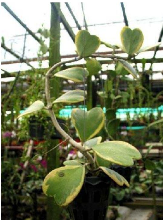
Left: A Hoya kerrii vine with albomarginated leaves.

Valentine's Day falls in the middle of February each year and that is also the time when the prices of roses reach astonishing figures everywhere. Although roses are traditionally associated with Valentines' Day, there are also other plants that can be used to convey your feelings to your loved ones.