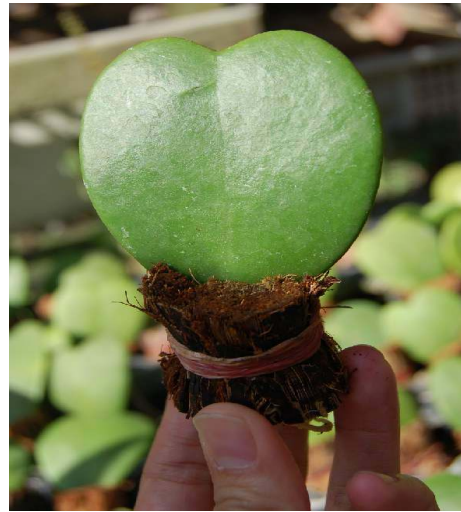
Right: A leaf cutting obtained from the all green, non-variegated version of the sweet heart hoya. (LJH)

Like many other Hoya species, the sweetheart hoya plant is a succulent vine that adopts an epiphytic growth habit. In its native habitat in Thailand, Malaysia and Indonesia, the plant grows in a small amount of medium. It climbs its way up a tree trunk and curl around branches to reach for light that it requires for photosynthesis. As it grows, it forms roots that help it cling onto surfaces for support and for absorption of moisture and nutrients.